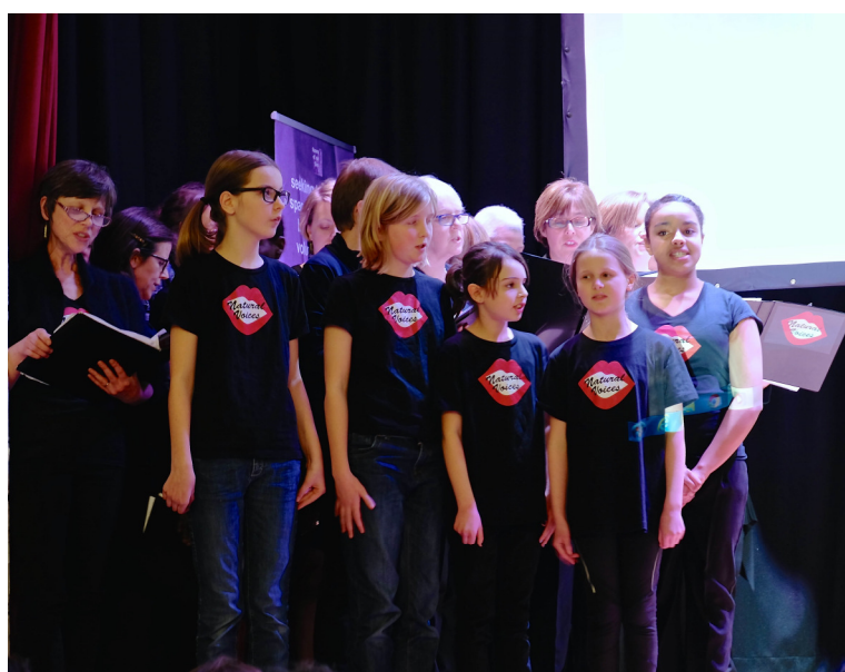
Natural Voices fabulous Youth Choir

“..... you can’t just take my dreams away”.