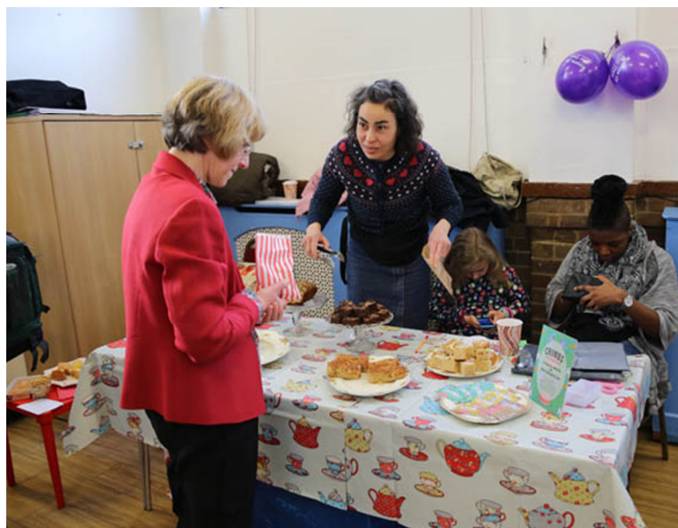
Impossible to have a women's event without lovely cakes