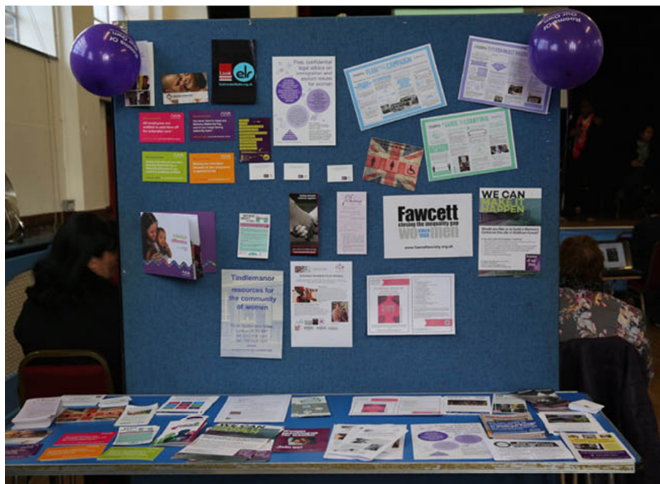
Leaflets about a whole variety of women's organisations on display