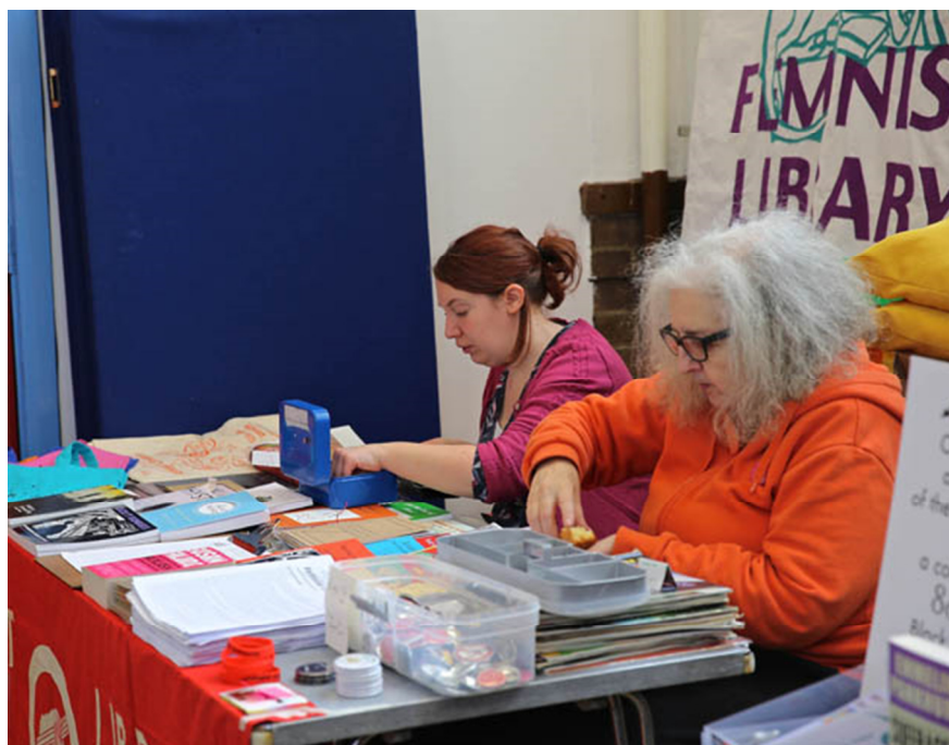
Feminist Library Stall http://feministlibrary.co.uk