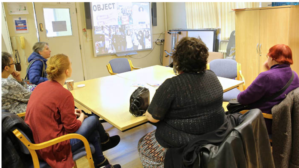
Workshop on Objectification of Women in the Media

Beti Baraki from OBJECT http://www.object.org.uk ran a workshop on Objectification of Women in the Media