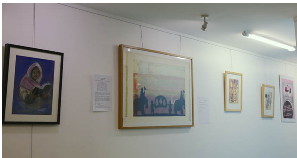
Part of the Feminist Art Exhibition