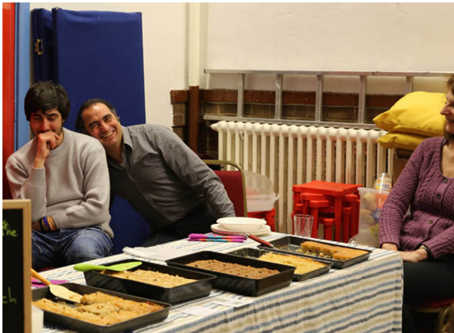
A Little Piece of Greek Sunshine

and of course for wonderful Greek Food supplied by A Little Taste of Greek Sunshine. You can follow them on twitter @GreekTreats