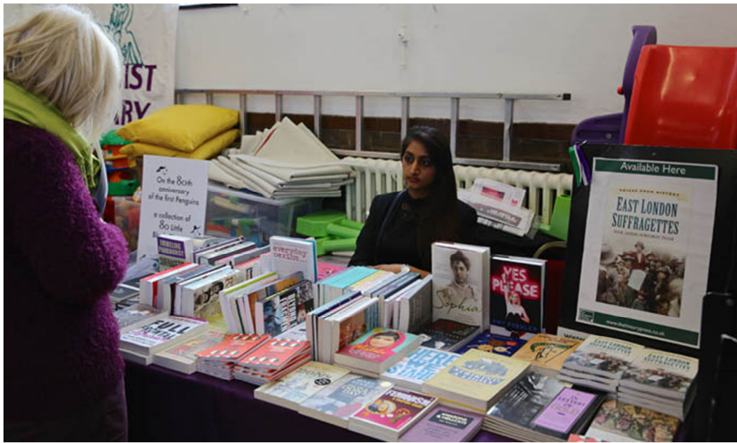
Newham Bookshop Stall http://www.newhambooks.co.uk