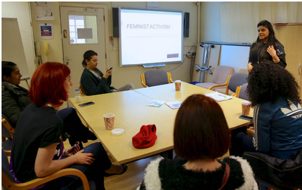
Workshop on Feminist Activism

https://www.facebook.com/WF.WomensNetwork ran a workshop on Feminist Activism