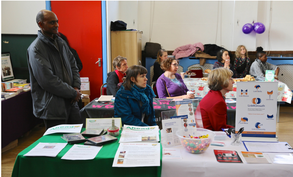
Stallholders including Ahead, Link4Growth, The Haven, Waltham Forest Women's Network, Newham Books, Feminist Library plus peripatetic stall, 50:50 Parliament

Rooms of our Own wanted to offer a showcase to all and any organisations working on women's issues in the borough and across London and indeed the UK. We only had room for a few stalls, but we did have two large tables and pinboards for organisations to promote their work and campaigns. Once the Centre is built, we hope that some of these organisations will be based at Rooms of our Own, either with a permanent or shared office, or for their regular meetings and events.